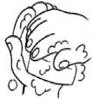
2. Soap (20 seconds)