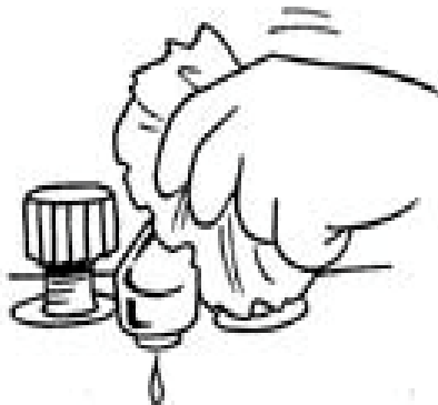
6. Turn off taps with towel