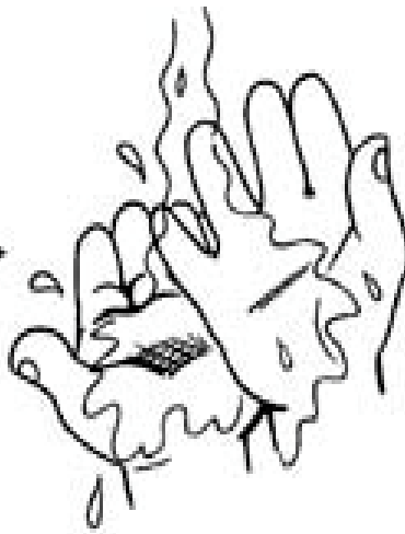
1. Wet hands