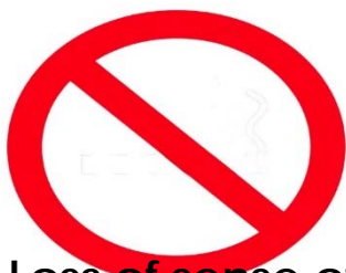
Loss of sense of smell