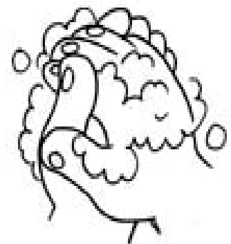
3. Scrub backs of hands, wrists, between fingers, under fingernails.