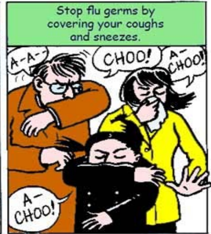
Coughing and sneezing etiquette