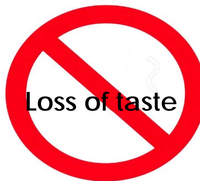
Loss of taste